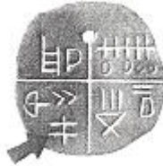
The Tartaria tablet

make them at least 1000 years older than the oldest Sumerian tablets found in Mesopotamia. The Tartaria tablets were made of local clay.